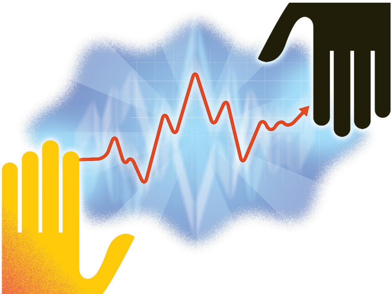
Illustration by Bryan Leister

A targeted training process is likely to get the expected results. Well, not exactly. Then, the organization needs to effectively recognize, reward, and measure success while extinguishing behaviors leading to failure. It's all about adding relationship building to the learning and performance mix.